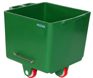
PE CONTAINERS Sæplast MS200 Buggy with bracket