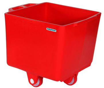
PE CONTAINERS Sæplast MS201 Buggy without bracket