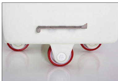
Integrated stainless steel brackets.