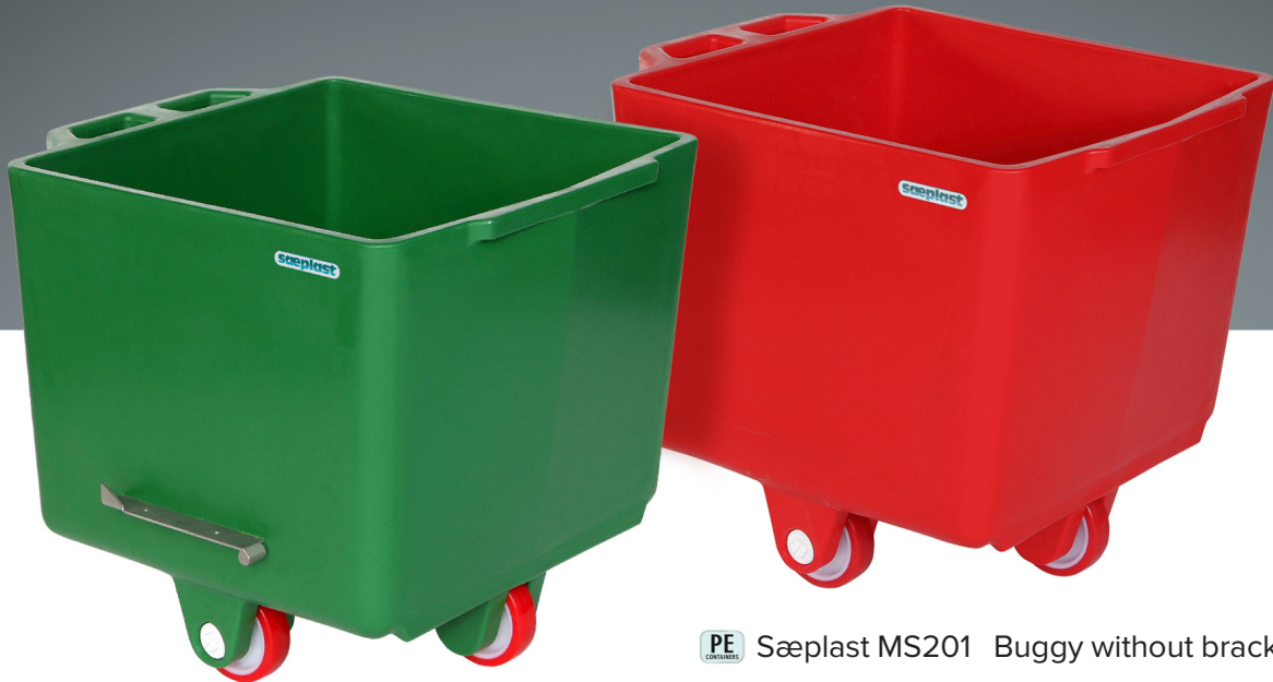
PE Saeplast MS201 Buggy without bracket